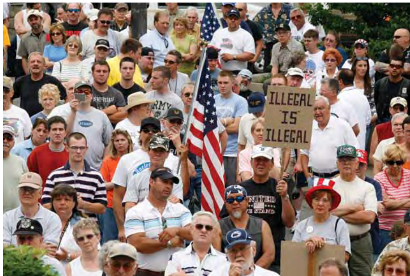
Supporters of Hazleton Mayor Lou Barletta and his anti-immigrant legislation gathered before City Hall in June 2007.

July 26, 2007 After 9-day bench trial, the judge strikes down both ordinances, writing, “Hazleton, in its zeal to control the presence of a