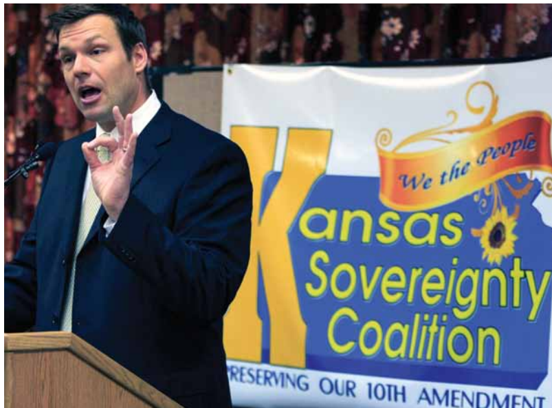
As a candidate for Kansas secretary of state last year, Kris Kobach associated himself with many conservative ideas. Here, he enthuses about the 10th Amendment, which delineates states’ rights.