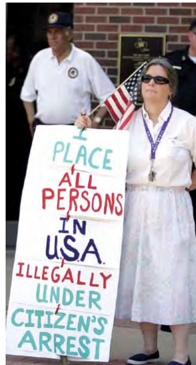
Protestor at Farmers Branch City Hall in August 2006

Nov. 13, 2006 The Farmers Branch City Council unanimously adopts an ordinance requiring renters to provide proof of citizenship or legal residency and fining landlords who rent to undocumented immigrants.