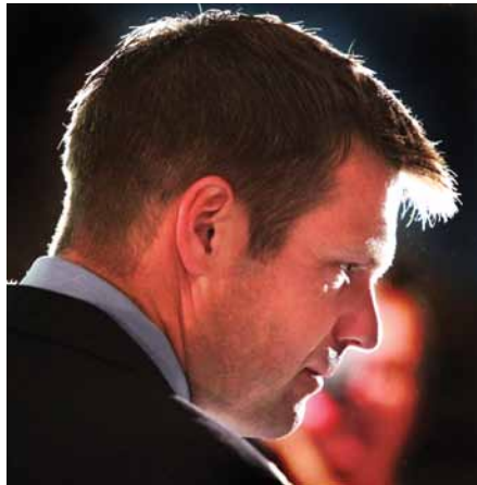
In town after town, lawyer Kris Kobach has helped to write and then defend harsh anti-immigrant laws. The cost to these communities, in terms of both dollars and race relations, has been immense.

Two years later, after a bruising campaign that finally led to the ordinance's approval in a special election last June, Fremont is struggling — and not only with the $750,000 in anticipated legal defense expenses that forced it to raise property taxes late last year. Like other towns around the country that have passed laws target-